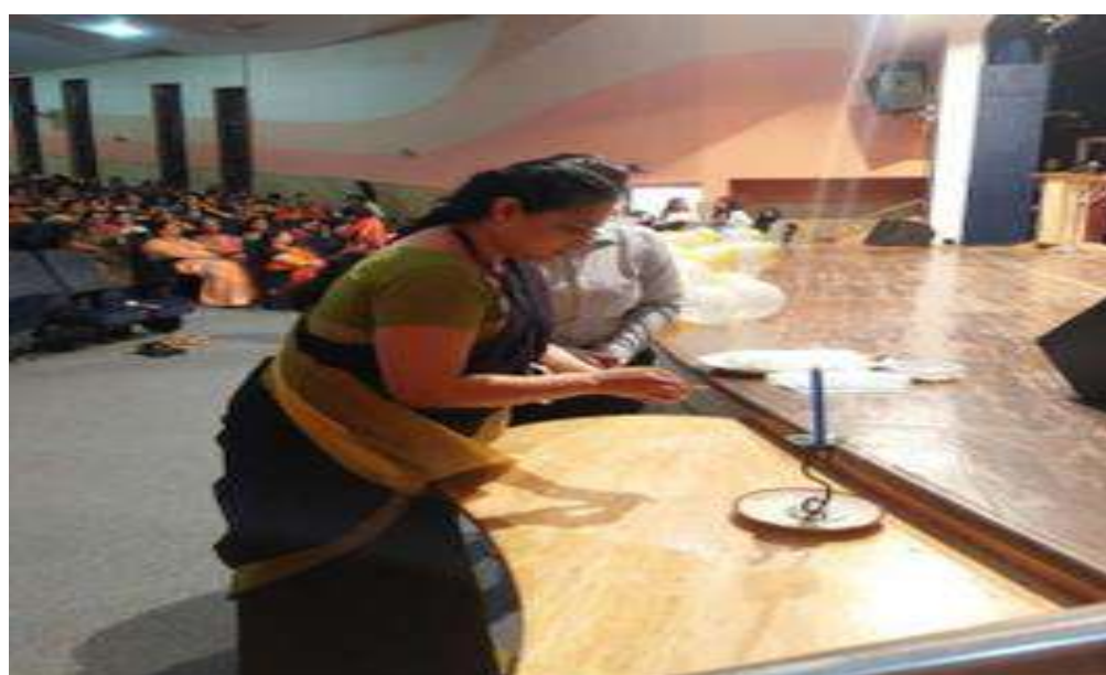
PIC2: Lighting of Lamp