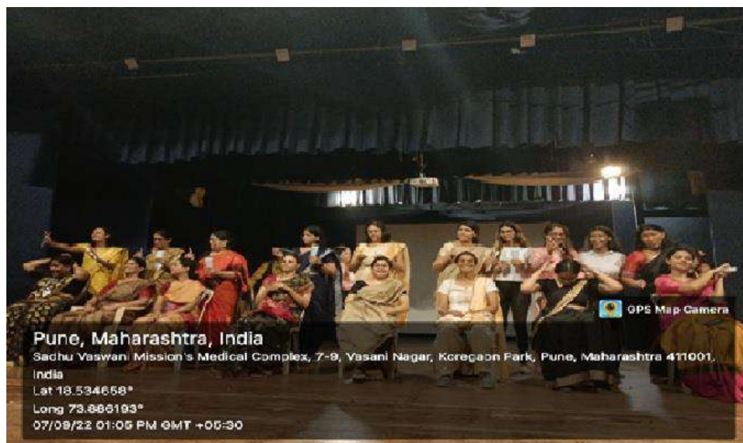
PIC1: Games for teachers