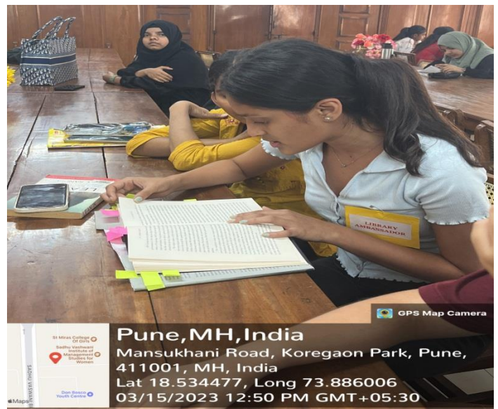
Students Reading My Life in Full