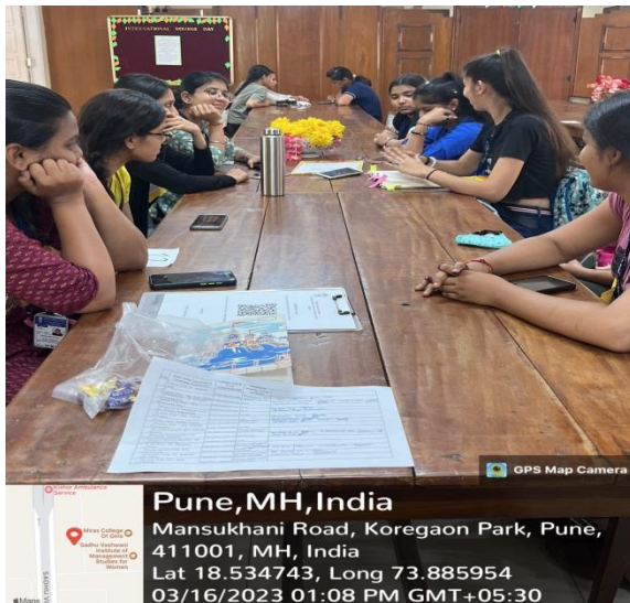
Students engrossed reading-My Life in Full