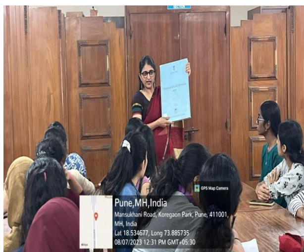
Students getting Information on resources on Census Success Review Magazine