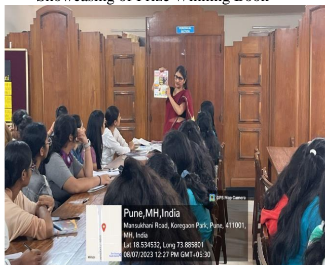
Students getting informed of Competition