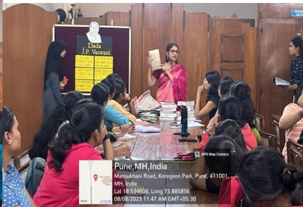
Showcasing of Prize Winning Book