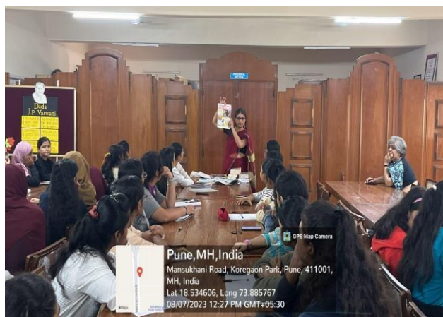
Librarian talking about useful Magazines